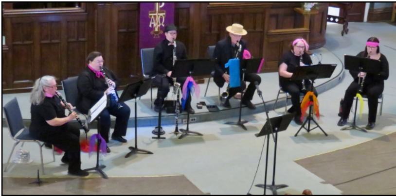
KLCB Clarinet Choir March 4, 2026