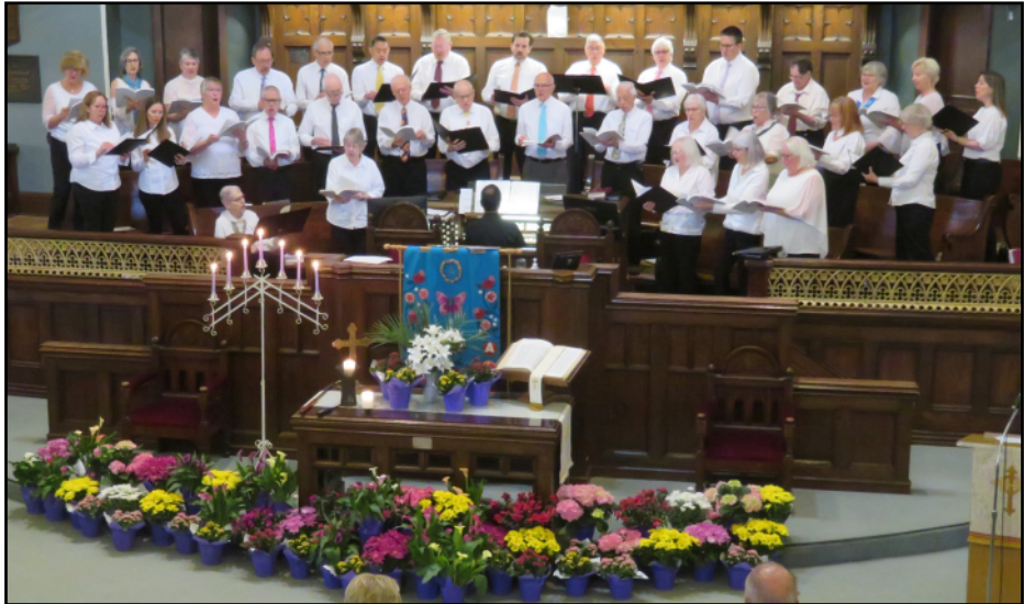
Easter Sunday Service - April 5, 2026.