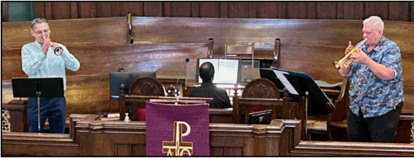
Trumpets and Beyond - February 25, 2026