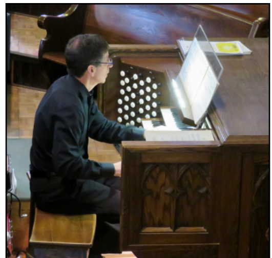
Bach to Vierre - March 25, 2026