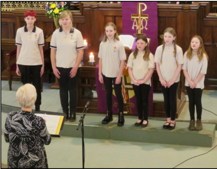
The Voices of Victory sang at the church service on February 22, 2026.