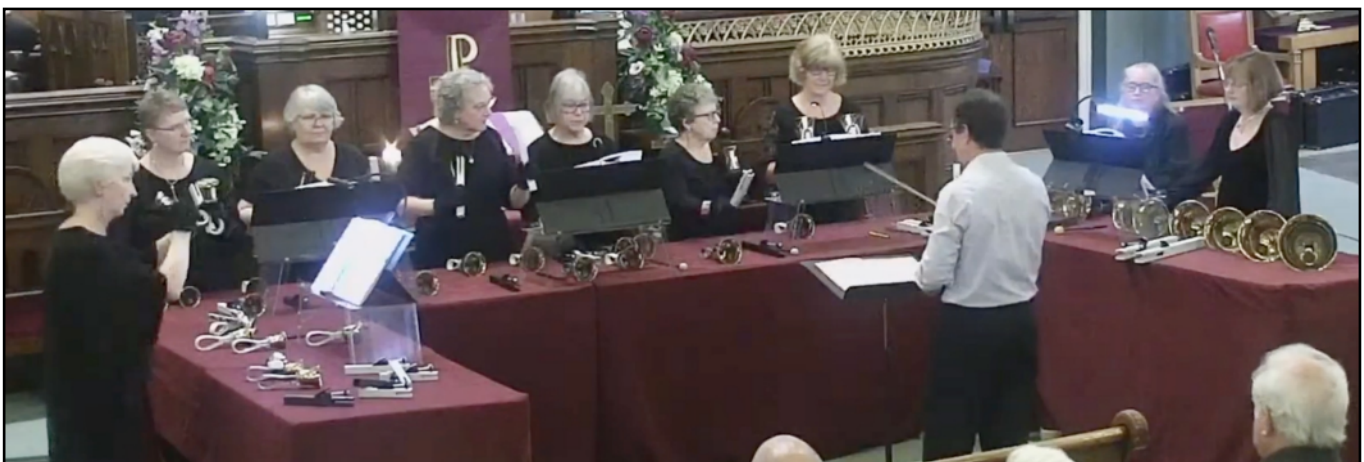
The congregation was delighted to hear the Bellchoir on March 10, 2026.