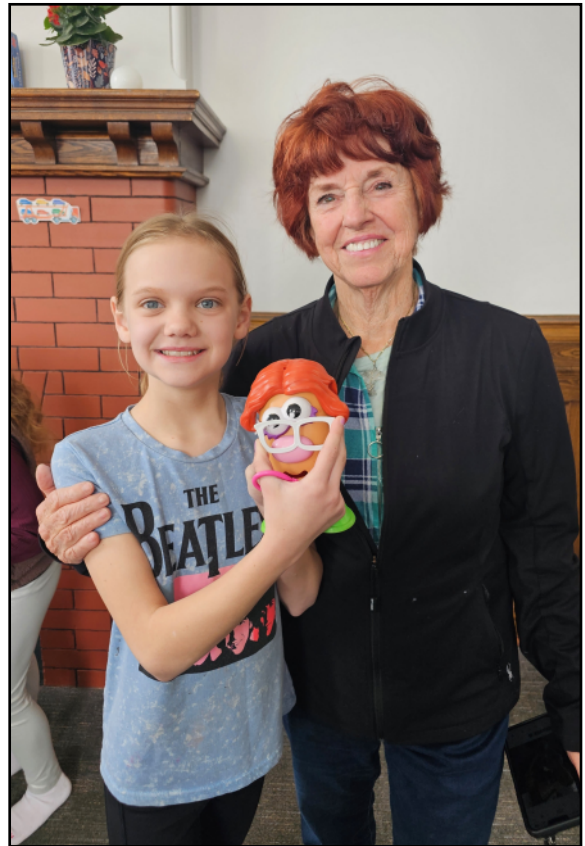
A student displays her artistic talent at the March Break Day Camp on March 19, 2026.