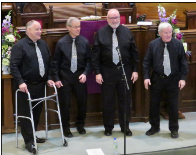
Oakridge Four Barbershop Quartet - March 18, 2026