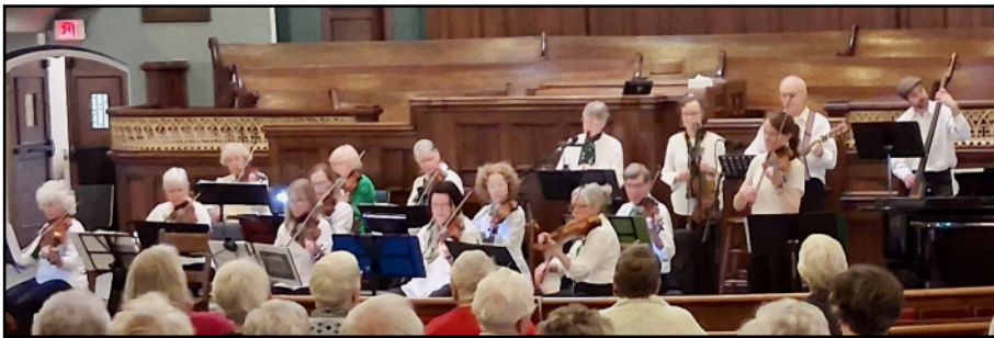
Seven Hills Fiddle Band - March 11, 2026