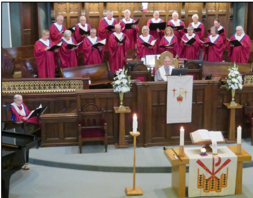
The Cambridge Street Singers sang during the church service on May 21, 2023.

So this is your call - come out and join us. If you don't like to sing or ring, maybe you can help the Music Team in organizing our Noon Hour Concerts or Concerts at Cambridge Street series. Here is a list of musical opportunities: