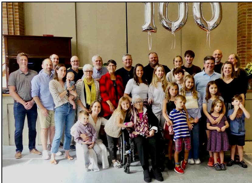
Nama's extended family was present for the celebration.